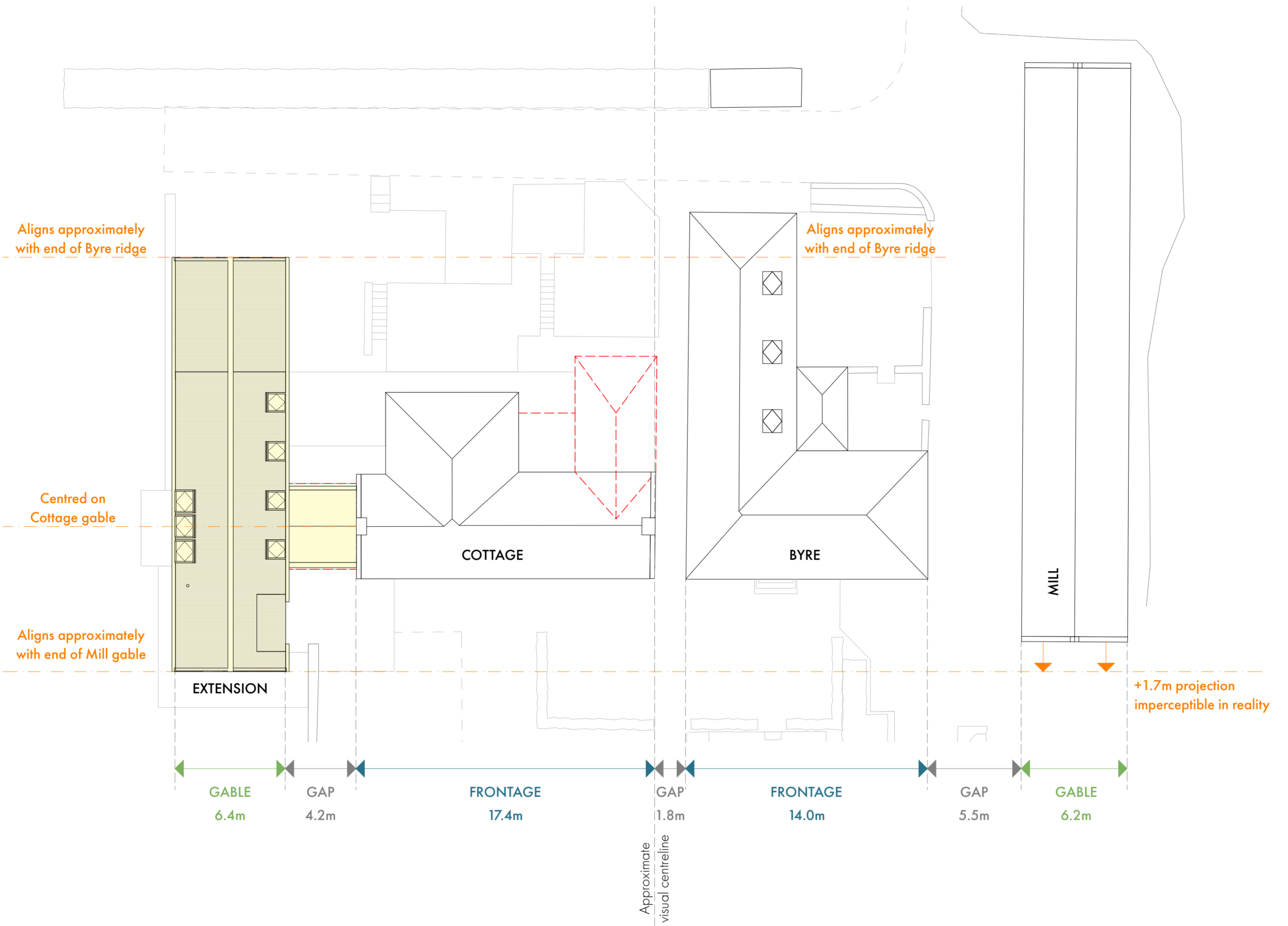
1 Site Plan Diagram 1:200